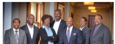
Team of African-American advisers making great strides, one inspiration at a time