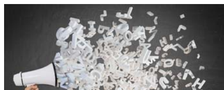
Marketing your practice with purpose