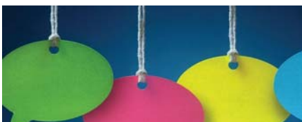
Social media all-stars of the financial advice community